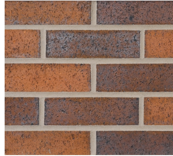
BR-1 BRICK MONARCH VELOUR GLEN GERY BRICK