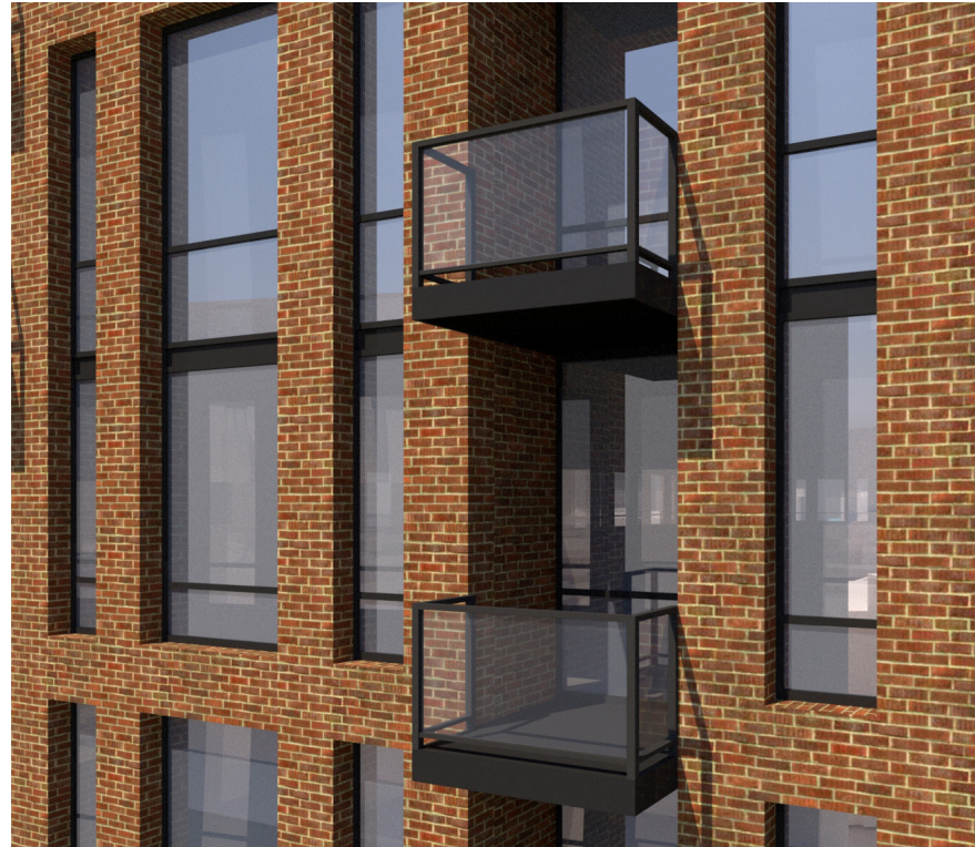
SOUTH CAPITOL BALCONY DETAIL