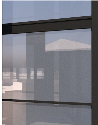
GL-1 GLASS SYSTEM