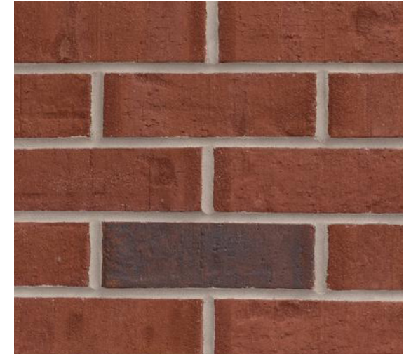
BR-2 BRICK KINGS MILL GENERAL SHALE