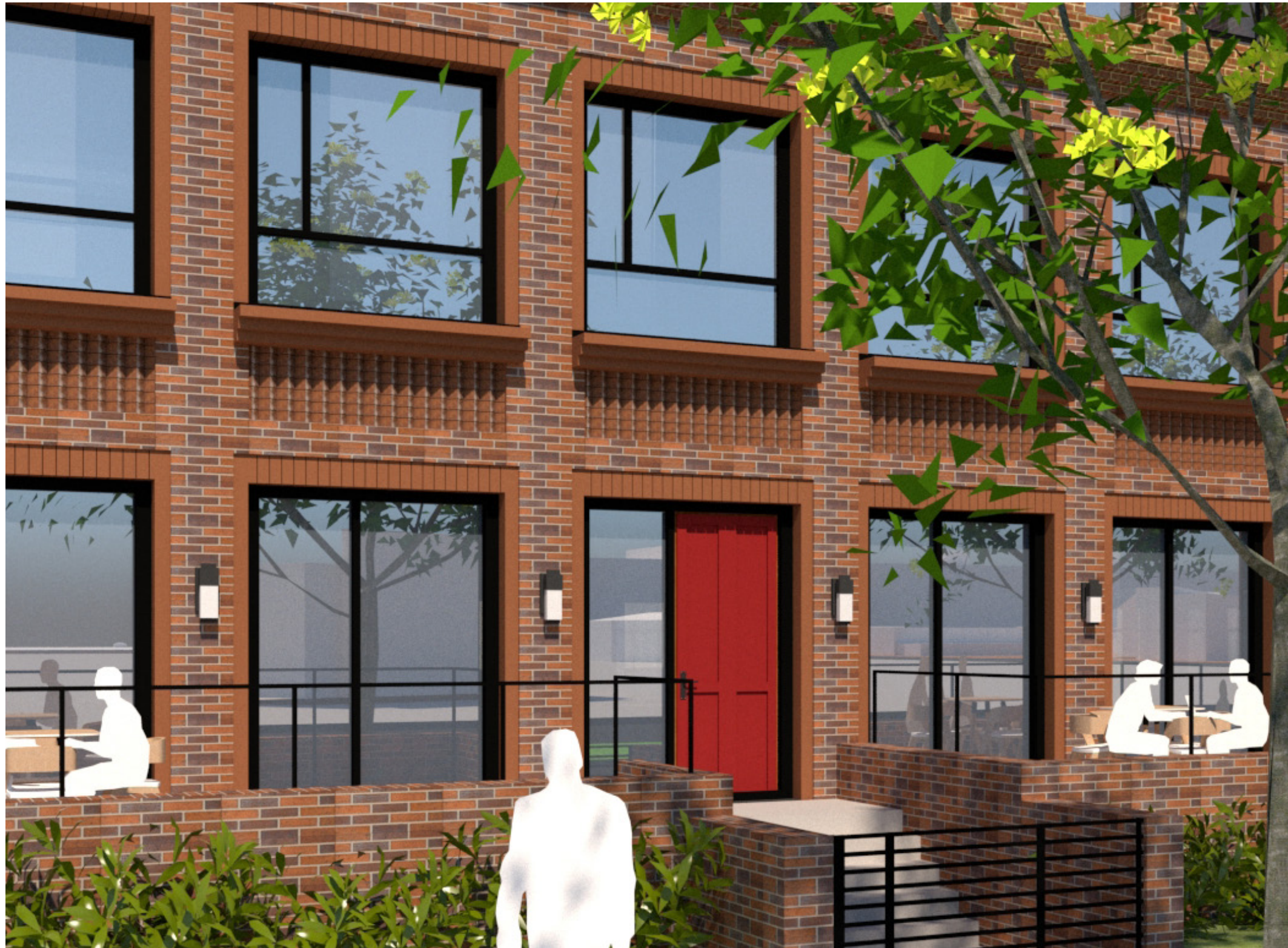
NEW PROPOSED SOUTH CAPITOL TOWNHOUSES